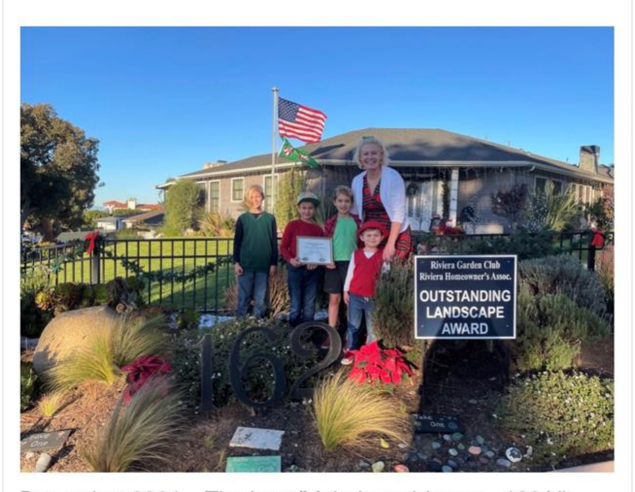
December 2021 – The Lent/Mykola residence – 162 Via Monte d Oro